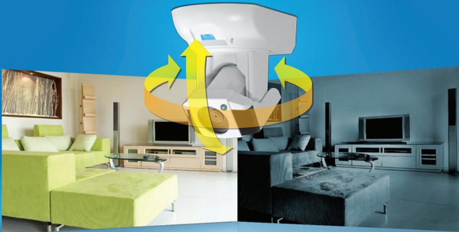
Motorized Pan & Tilt with 10x Digital Zoom